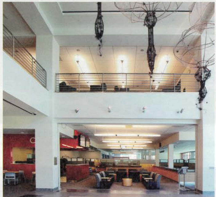
THE NEW GUARD Clockwise from top: The 17th Street Beach Safety Center in Del Mar by Jeff Katz Architecture; The San Diego County Operations Center by RJC Architects; Snooze in Hillcrest by Public Architecture; Harbor Aquatic Center restroom by Safdie Rabines

projects—we won't name names—got nods for Orchids.