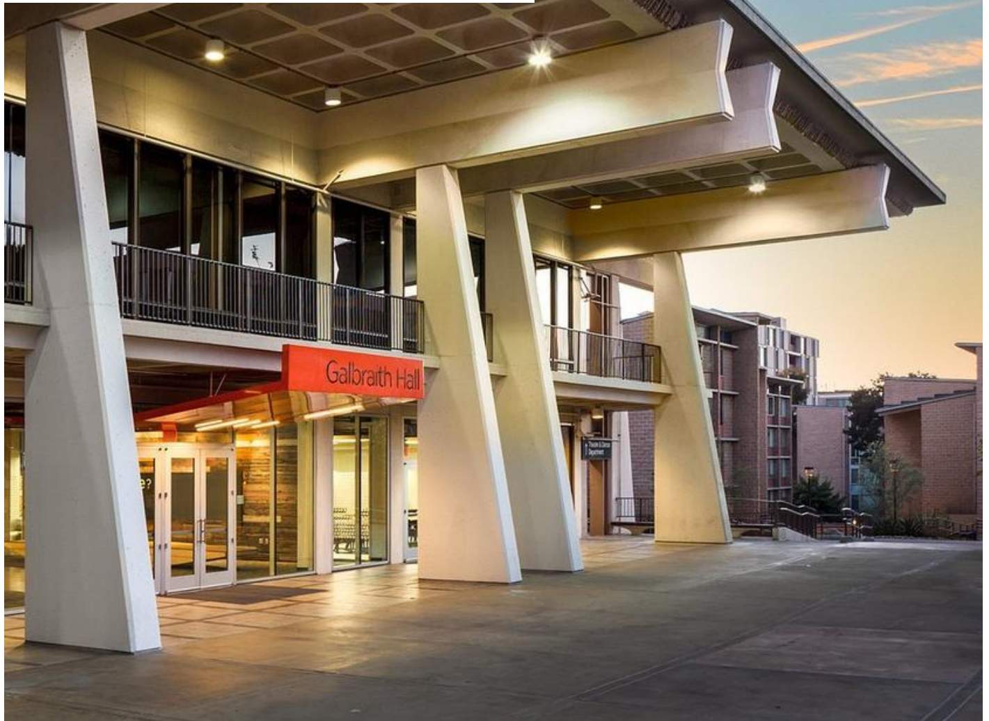
An Orchid for architecture went to architect Kevin de Freitas' interior redesign of this 1965 UC San Diego building, Galbraith Hall.