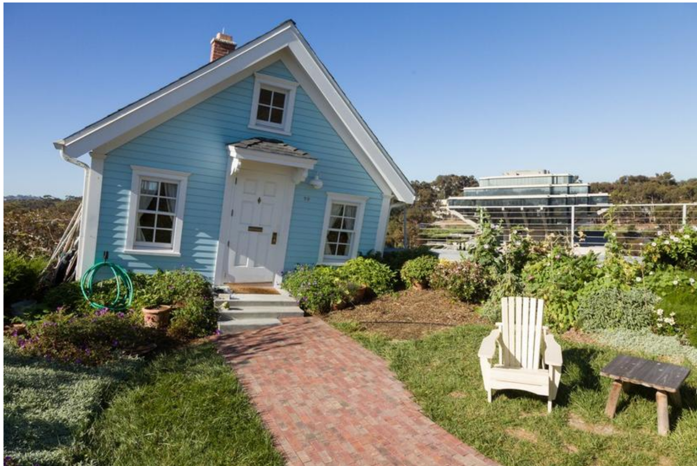
"Fallen Star," an art installation by Do Ho Suh atop a UC San Diego engineering building won the Grand Orchid.

Here is a list of the winners and losers in the Orchids & Onions contest, sponsored by the San Diego Architectural Foundation. Included are the name, location, developer or sponsor, and designer. See orchidsandonions.org for contest details and more photos of the nominations and winners present and past.