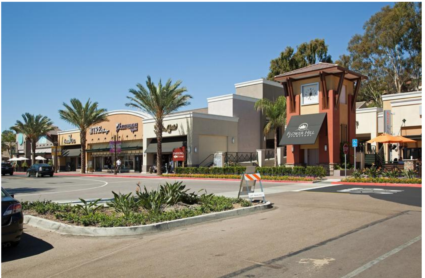
The Flower Hill Promenade in Del Mar won an Onion for architecture. The developer was Protea Properties and the architect, SGPA Architecture and Planning.